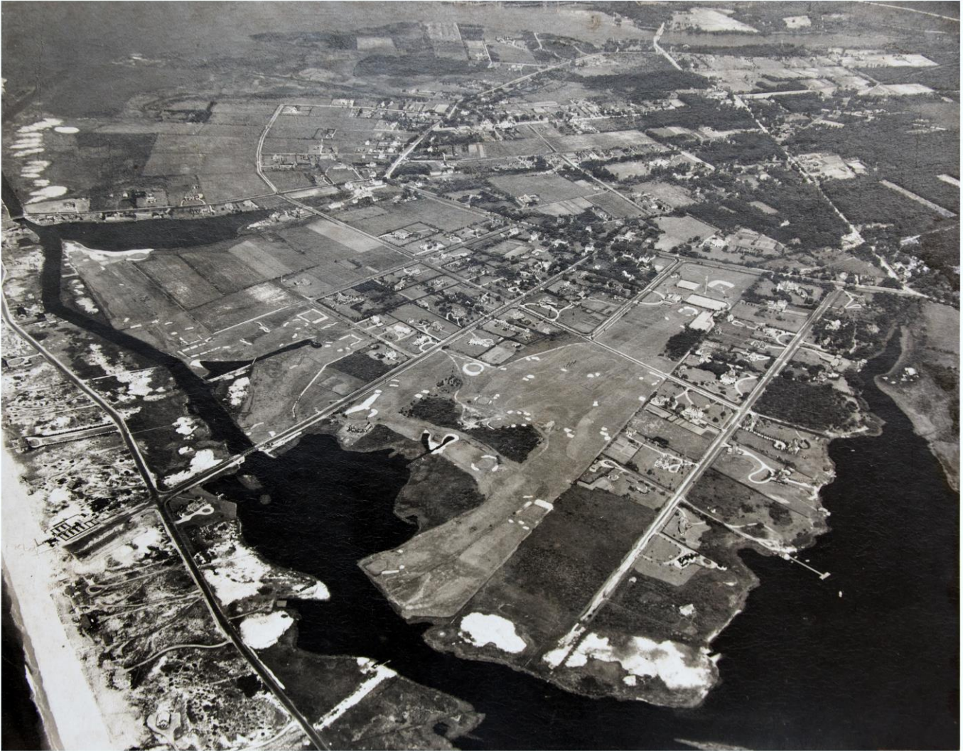
Village of Quogue, ca. 1935.