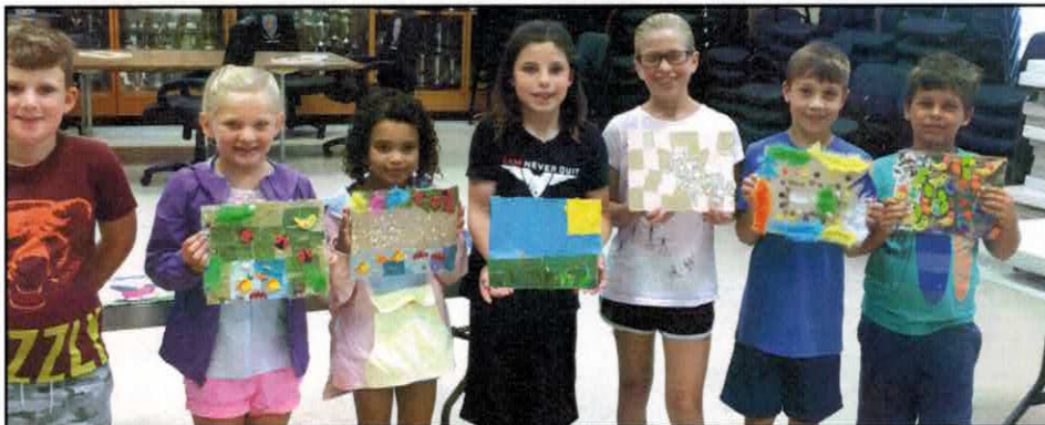
Proud participants display their work at Art Show 2018.

We are pleased to report that more than 50 house-proud owners of "contributing properties" have purchased bronze plaques to display on their homes. We encourage more property owners to contact us to learn about the history of their property and display it on a plaque. The Society provides research assistance to determine the date of construction and a historic name, if any. A list of the "contributing properties" in the Historic District eligible to display a Historic District plaque, as well as the form of application to purchase a plaque, can be found on the QHS website. ( www.quoguehistory.org/preservation/current-projects )