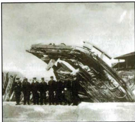
Life saving crew in front of wreck

to restore the anchor and display it on a Belgian block circle about 10 feet in diameter in front of the Library. An unveiling ceremony is expected to take place in August 2016.