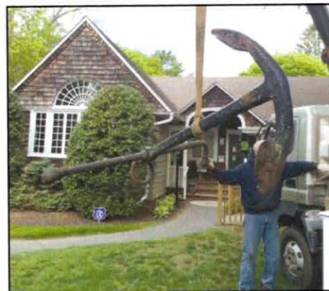
ANCHOR AWAY - Nahum Chapin anchor moved for restoration